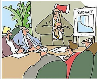
"Strategic plan B: We chop down all the office plants and grow vegetables."